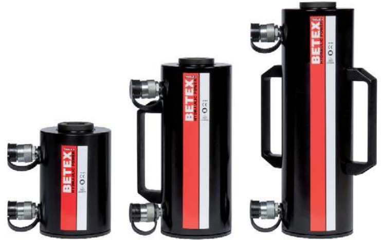
Model ADHC cylinders 30-60T