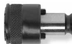
For MAS...B, MASE...PB tappers

These tap holders are used for high precision tappings in dead holes to avoid the tap breakage. They permit to work rapidly also with different size taps. Each tap requires a specific tap holder. These tap holders have to be used with: MAS...B, MASE...PB (chuck code 659411002), MAY...B, MAY...PB (chuck code 659511002).