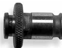
For MAS...B, MASE...PB tappers

MAY...B, MAY...PB (chuck code 659511002).